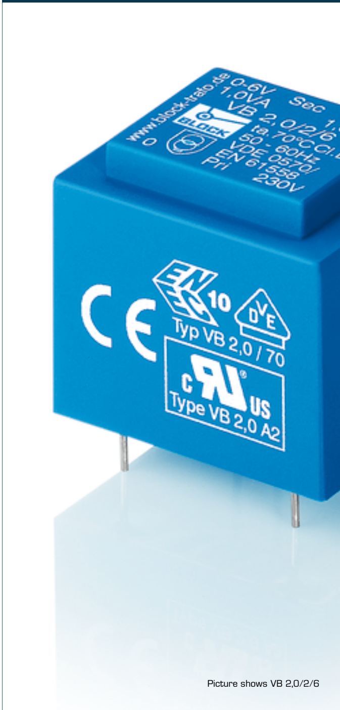
Picture shows VB 2,0/2/6