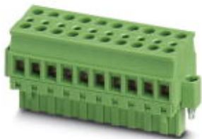
The illustration shows the 10-position version

Plug component, Nominal current: 12 A, Rated voltage (III/2): 400 V, Number of positions: 5, Pitch: 5.08 mm, Connection method: Screw connection with tension sleeve, Color: green, Contact surface: Tin