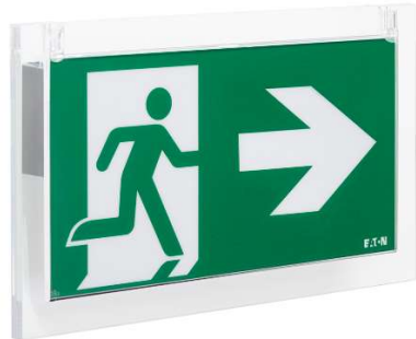
CrystalWay 20m - Centrally Power System